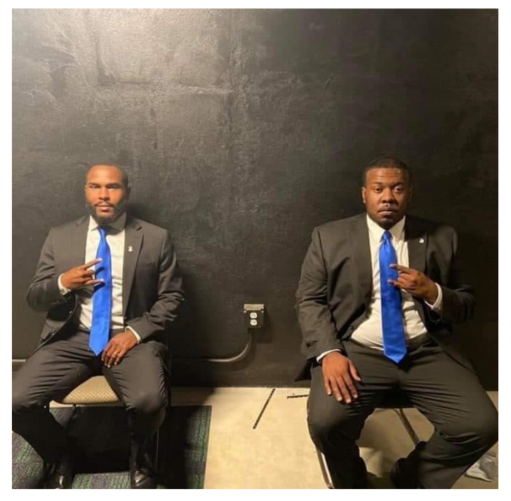
Eta Lambda Sigma - Oxford