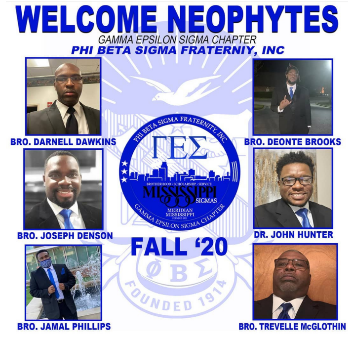
Gamma Epsilon Sigma - Meridian