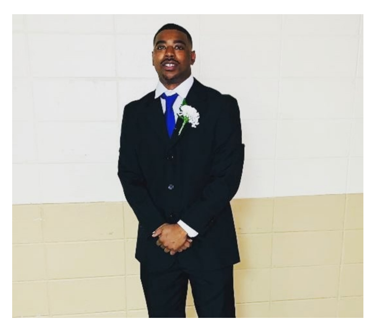
Kappa Epsilon Sigma Chapter - Vicksbug

Find us on Facebook: @MississippiSigmas and @MSsigmabetas | Instagram:@mssigmas_1914