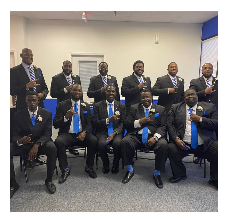
Delta Tau Sigma - Holly Springs