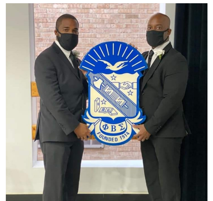
Pi Tau Sigma - Columbus