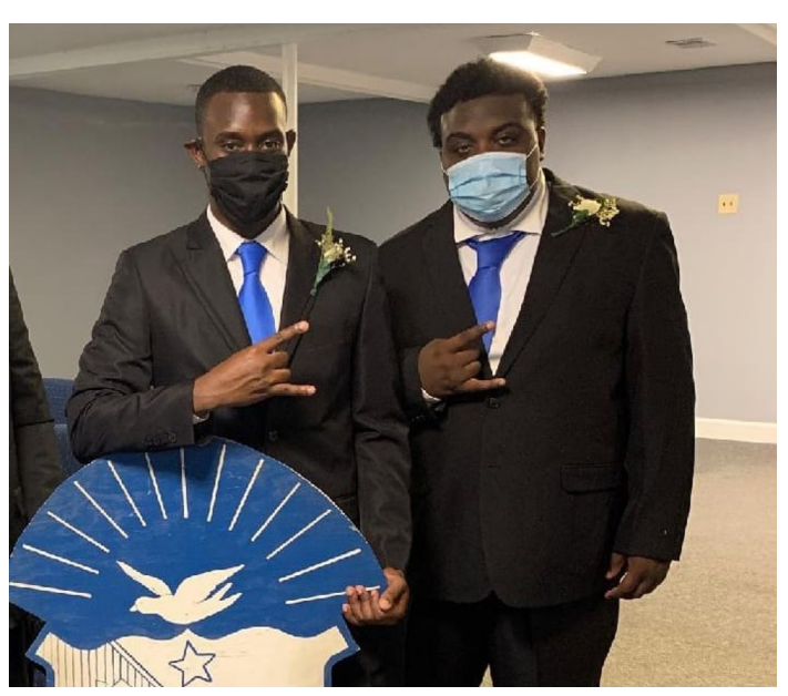
Delta Alpha Sigma - Hattiesburg